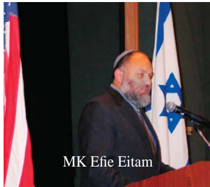
MK Efi Eitam

By placing our joint Judeo-Christian values and teachings front and center, M-EDG (say: "Image") demonstrated the importance and ability of Jewish and Christian business people to take the lead in developing local community support for Israel – support that will in turn bring blessings to both Israel's economy and our own here in the United States. M-EDG's leaders hope that other companies will rise to the challenge as well.